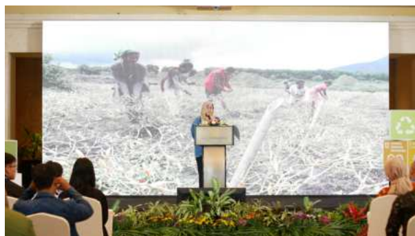
Figure 3. Remarks by Representative of United Nations Information Centre (UNIC) Indonesia