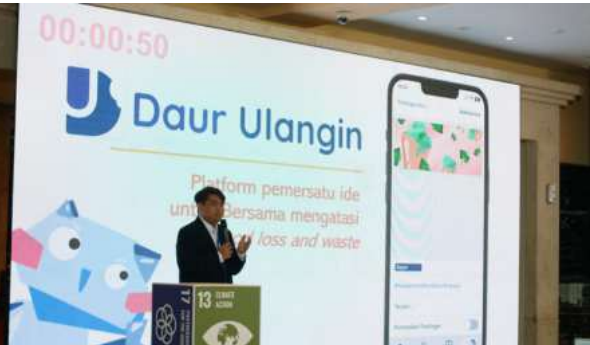
Figure 12. Presentation of the idea and business plan of the Recyclein Team