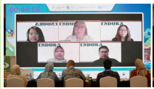
Team Endura's idea and business plan presentation