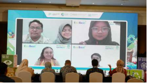
Figure 18. EcoSeal+ Team presentation of idea and business plan