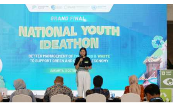
Coach Talk 1: Burgreens