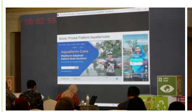
Coach Talk 2: Aquafarm Care