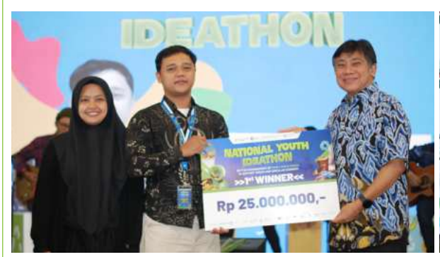
IDEATHON 1st place prize handover