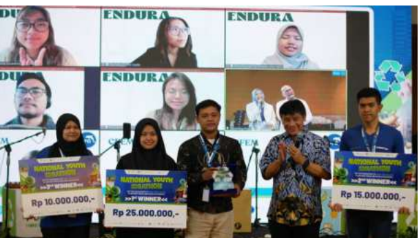
Prize giving for 1st, 2nd and 3rd place winners of IDEATHON