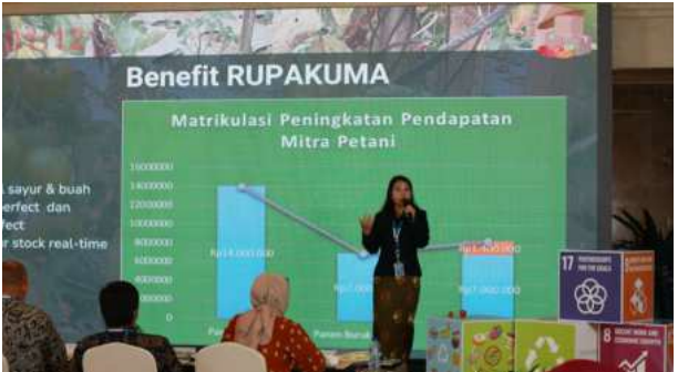
Gmbar 20. Rupakuma Team presentation of ideas and business plan