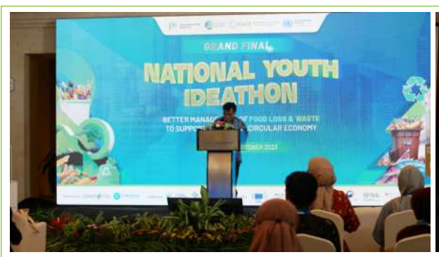
Figure 1. Welcome and Opening Remarks by the Director of Environmental Affairs, Bappenas