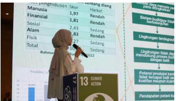
Figure 19. Presentation of the Food Estate Team's idea and business plan