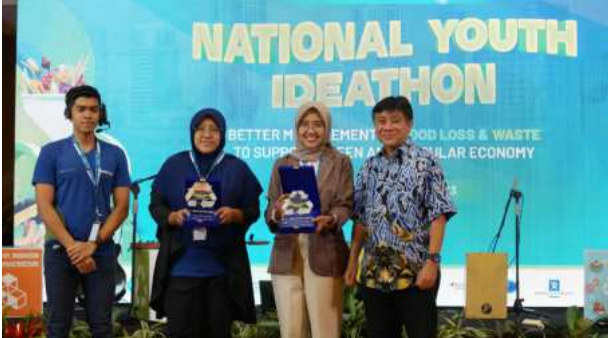
Award to the Proposal Jury Figure 24: Appreciation to the Proposal Screening Jury