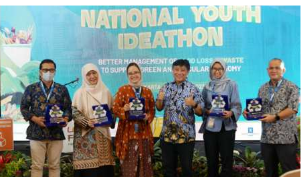
Figure 26. Appreciation to the Grand Jury