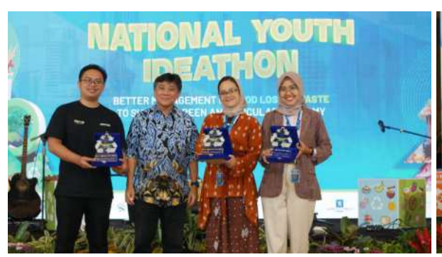
Figure 25. Appreciation to Coach