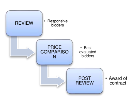
Figure 4. Evaluation of bids